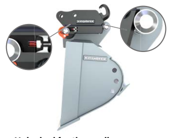
Unlocked for the couling process. Indicator pin is extended.