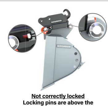
permitted range. Indicator pin is extended.