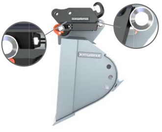
Safely locked. Indicator pin is driven in.

Package consists of: hydraulic quick coupler with drop stop claws and lock indicator