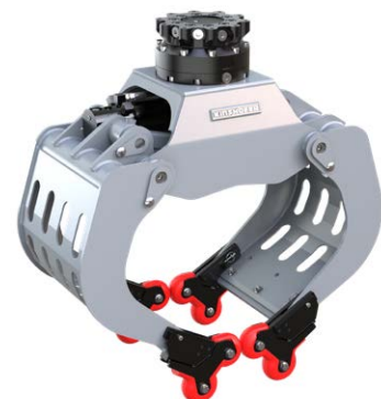
optional 4-Grip gripping device, here mounted to a D09H